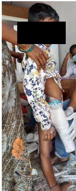
Child with LowerLimb Amputation from Thiruvapur, Tamilnadu