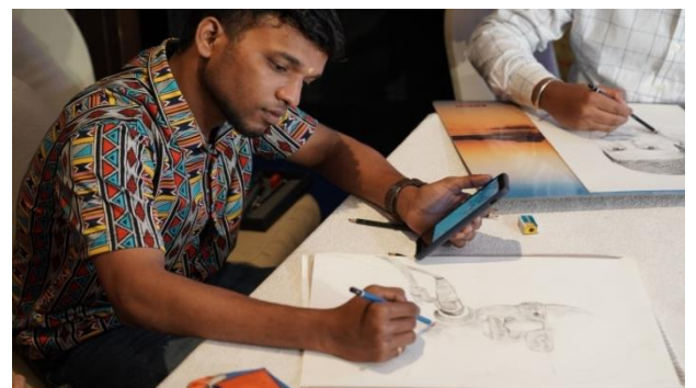
Pearls' performances and drawing by Scholars