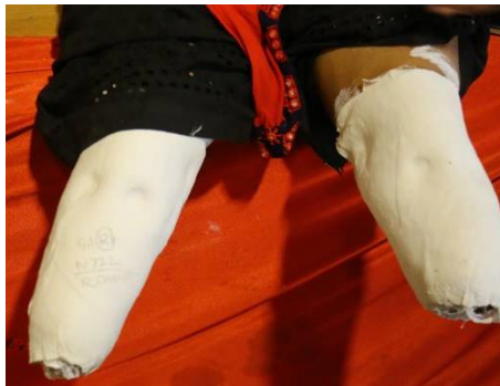
Bilateral Lower Limb Amputee from Nashik, Maharashtra