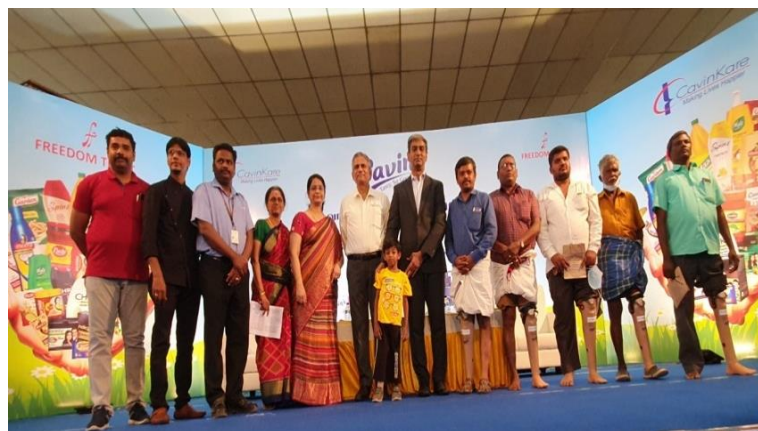
Artificial limbs Lined Up for Distribution at Bhavani