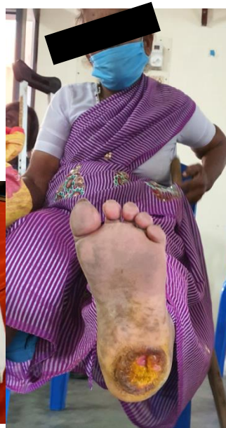
Non healing ulcer