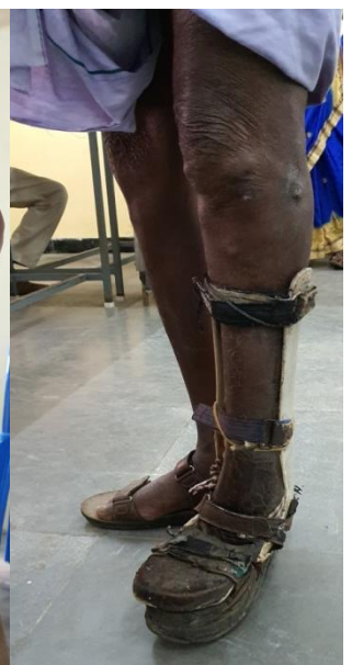
Symes Amputee from Thiruvapur, Tamilnadu